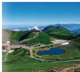
Mt. Norikura Tatamidaira